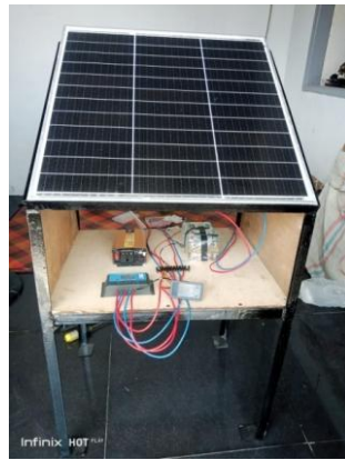
Figure 2. Solar Panel-Based Powerbank with BMS Control System