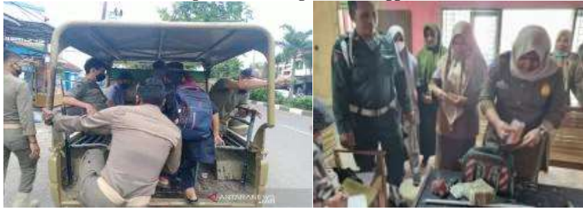
Figure 1 Handling Process Beggar