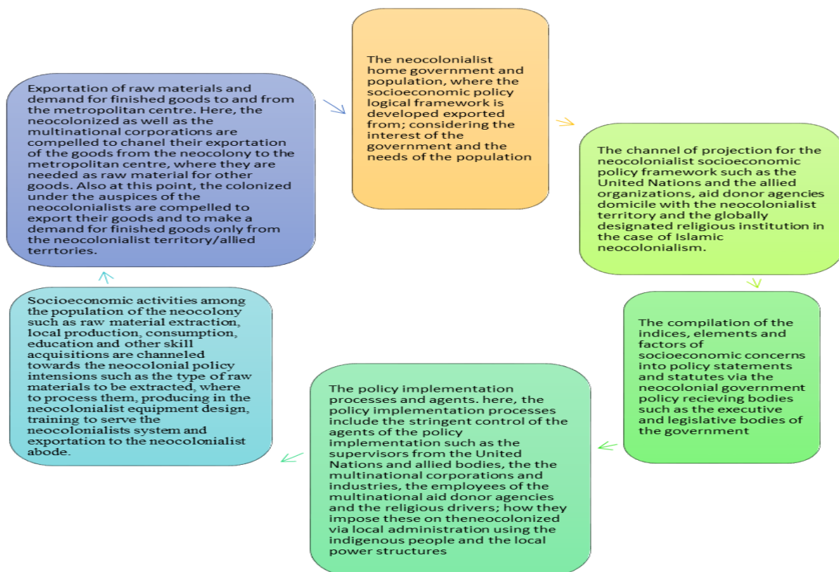
Figure 2. The Diagram Showing the Logical Policy Framework of the Neocolonial Socio-economic Policies

The penultimate orbit in the network of the neocolonialist socioeconomic logical framework is the socioeconomic activities in the neo-colonized territory. The socio-economic activities are usually locked in the socioeconomic policy, which had been developed in the direction of the already designed policy framework from the neocolonialists, via the globally designated organizations. As a matter of fact, the socio-economic activities will acknowledge the interest of the neo-colonialist, unknown to the neo-colonized both at the governmental levels and at the level of the poor masses. Education, production, consumption, and other socio-economic activities will be patterned after the taste and interest of the neocolonialists. The last orbit in the network, which finally links back to the originator of the neo-colonialist socioeconomic logical policy framework, is the direction of export and import among the neo-colonized. Having been patterned after the neo-colonialist taste and interest in the production and consumption processes, the exportation of raw materials and importation of finished goods are automatically locked in the direction of the neo-colonialist agenda.