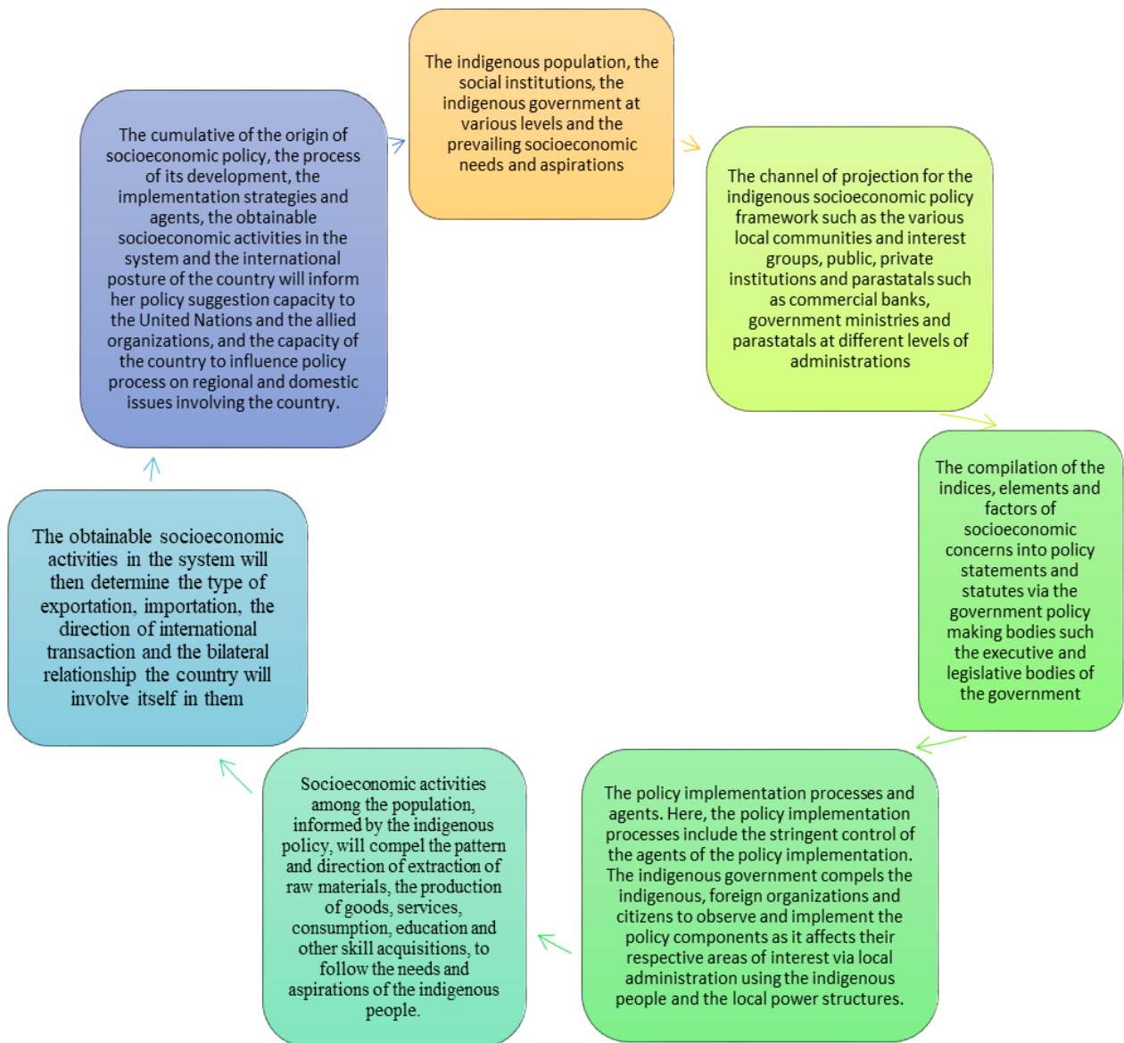
Figure 3. The Diagram Showing the Logical Policy Framework of Policy-Decolonization

For sustainable development to take place, the socioeconomic policies must originate from the circumstances surrounding the population in question for maximum result and self-sustaining cycle. These circumstances directly affecting the population are subject to diverse processes of capturing, comparison and evaluation before they become socioeconomic intelligence. While sponsored research is one of the processes, non-sponsored research, public opinion from individuals, interest groups, and academia from the system are equally important. For the colonialist government to be successful in Nigeria (though in the negative direction), there were accumulated intelligence from the government and nongovernment anthropologists, economists, archeologists, and other social scientists, who penetrated the population to understand the