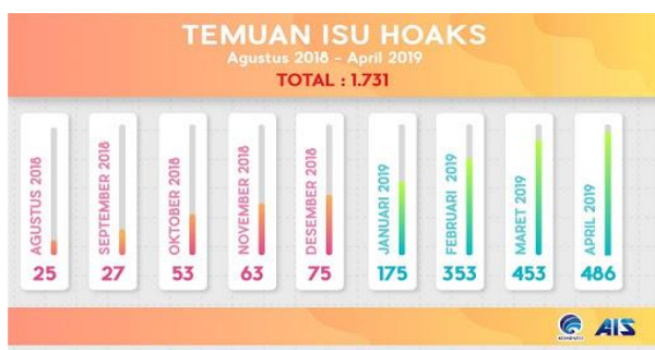
Figure 1. Data on Hoax Issues Findings

The problems of hoax reporting in the media today have had various consequences for social disharmony, especially about strategic matters relating to public policies. This happened not only at the national level but also at the local level, such as in Aceh. The leadership contestation in the 2014 presidential election, and 2019 in the second term of President Jokowi's leadership, the President of the Republic of Indonesia, found a lot of news in the media classified as hoax news as the data submitted by the Ministry of Communication and Information of the Republic of Indonesia during August 2018 - April 2019.