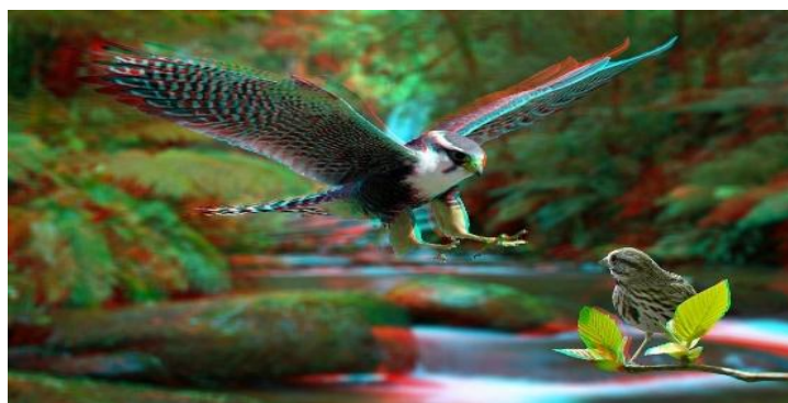
Figure 2. 3D Stereoscopic Images