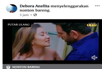
Figure 1. Capture Pornographic Videos

In these groups, the learning process is carried out in groups seeing or observing the grub groups on Facebook social media. There are several examples of behavior that could become a crime if members forget about the norms and laws that exist in society. Distributing pornographic photos, videos, or links includes the behavior of teenagers in the grub and can be called a crime because it has a detrimental impact on other people and members who follow them. With the support of the group to protect fellow grub members, they will do things that can benefit or even harm other grub members. In the members of the Indonesian Youth Grub Caption, the researchers found and captured posts that contained pornographic video elements as shown in Figure 1 below.