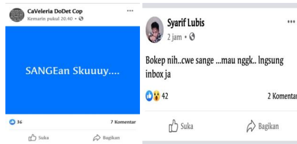
Figure 2. Words Frequently Used by Teens on Facebook Social Media Groups

The following are the words that are often used by members of the Indonesian Youth Grub Caption, which are presented in Figure 2.