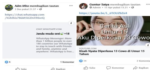
Figure 3. Whatsapp and Youtube links to the Indonesian Youth Caption Group

This condition is what happens to adolescents who are members of the Indonesian Youth Grub Caption. They hang out with so many negative friends that others will follow suit. Humans spend the act to socialize with the existing environment. Interestingly, there are many things in this interaction that can influence the behavior of an individual. Then the process of these activities will eventually lead to the same point. Sutherland stated that meetings focus on colleagues or family and groups as the most likely sources of initiation into delinquent values and activities (Bosiakoh & Paul, 2010).