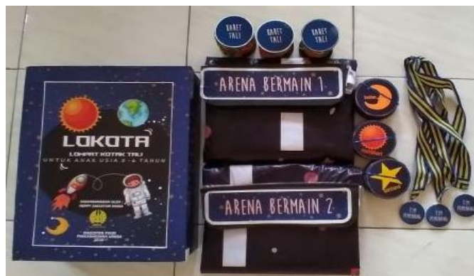
Figure 1. Traditional Media Game Jumping Rope Modification “Lokota”

The final product of this development is the traditional game media of jumping rope modification and the media Use guide book to stimulate the gross motor and social child group B. Traditional game Media of jumping rope modification consist of playground, rubber rope, Gaco and medal necklace. The playground is made from a flexi banner fabric measuring 3, 5mx3, 5m divided into two parts, the playground 1 and playground 2 that can be combined with each other. Rubber straps are made colorful with the accompanying containers to roll with a size of 3m per rubber.