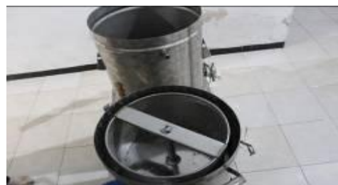
Figure 6. Construction Equipment Performance Third Oil Peniris

Oil drainer tool is designed with the goal of keeping the product fried onions become more healthy and durable. The materials used for the manufacture of oil drainer tool which consists of dynamo, sainlist plate, angle steel, banbel and stainlish sieve. Oil drainer tool diameter is 500 mm long, 500 mm wide and 500 mm high with a capacity of 2 kg of onions.