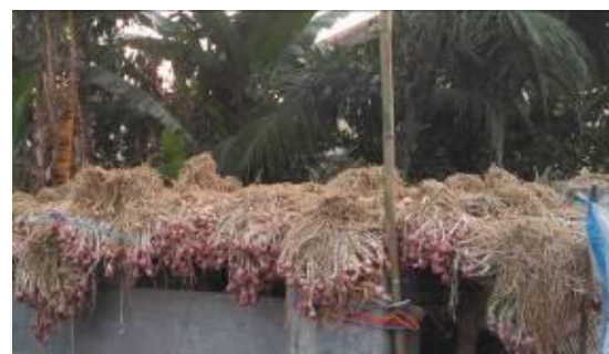
Figure 2. Preliminary Survey Results Shallots are Abundant Harvest.

Red onion becomes a commodity crops high level permintaanya good market for raw onion or shallot to refined, this is because the onion one herb that is always used in every Indonesian cuisines, so the demand for onion in Indonesia is very high either. However, despite the high market demand for red onion did not make the onion farmers prosper. This is because the price of onions in the market depends on the quality of onion sold. Onion