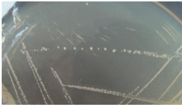
Fig. 4. Bacterial colonies of L. garvieae isolated from moribund fish