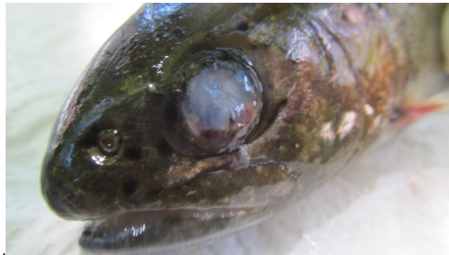
Fig. 2. Opacification in eye of the moribund fish affected by lactococcosis