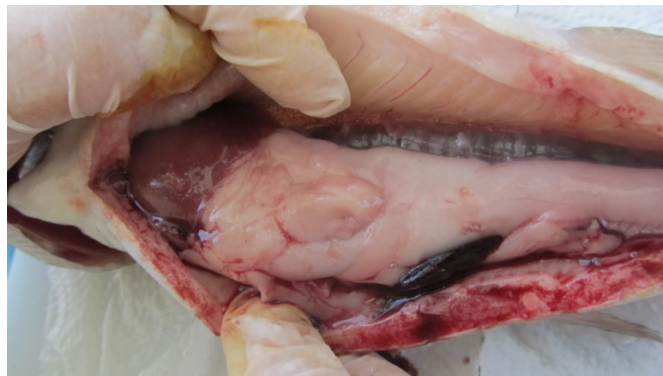
Fig. 3. Hemorrhages in the muscle pyloric caeca, splenomegaly and darkening of the spleen in the moribund fish.