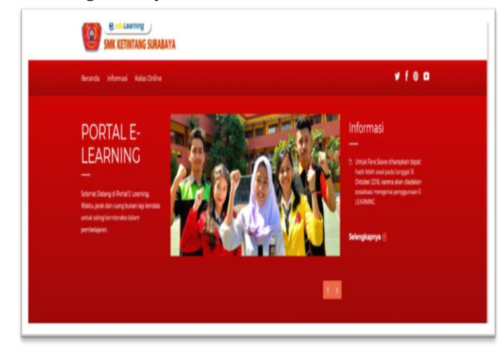
Figure 2. Display of Edu-learning SMK Ketintang

With the address http://smkketintang.edulearning.me/, all components in SMK Ketintang are expected to maximize the use of edu-learning. Edu-learning is equipped with chat and teleconference features, so that teachers and students can interact interactively and communicatively. With the existence of edu-learning is expected to improve the quality of learning and work productivity of teachers at SMK Ketintang Surabaya.