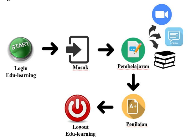
Figure 1. Online Learning Flow using Edu-learning

The flow of online learning using edu-learning is as shown in Figure 1 below.