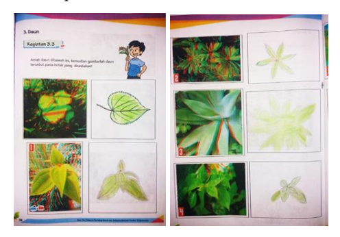
Fig. 4 Examples of observation Activities in textbook with a Stereoscopic 3D images

In figure 4 show that the integration of stereoscopic 3D images in textbooks is to carry out the observation activities of animal body shape and function. Through the integration, students are invited to carry out observation activities by observing stereoscopic 3D images and then filling in a few questions on the observation sheet.