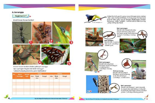
Fig. 3 Examples of Integrating 3D Stereoscopic Images in the Textbook

In figure 4 show that the integration of stereoscopic 3D images in textbooks is to carry out the observation activities of animal body shape and function. Through the integration, students are invited to carry out observation activities by observing stereoscopic 3D images and then filling in a few questions on the observation sheet.