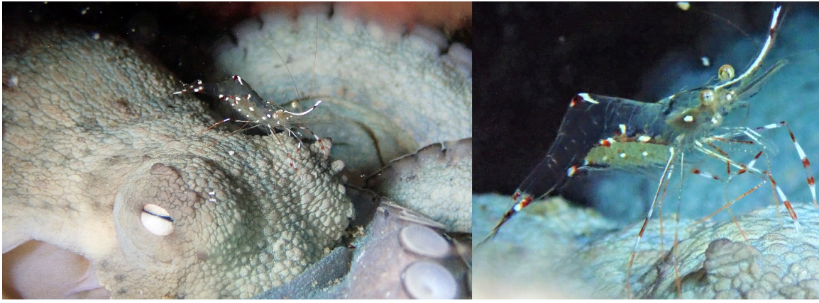
Figure 1. The nocturnal cleaning relationship between O. vulgaris and U. pulchella (female) in the Iskenderun Bay.

On 29<sup>th</sup> November 2018, a female individual of U. pulchella was observed with O. vulgaris in a rocky crevice in the Iskenderun Bay (Keldag) at 16 m in depth during the night dive (Fig. 1). The nocturnal cleaning event between U. pulchella and O. vulgaris was recorded with photos and video using a digital underwater camera. Identification for U. pulchella was carried out using the information provided in Yokes & Galil (2006). Identification for O. vulgaris was made according to Sweeney et al. (1992). The distribution of U. pulchella in the Mediterranean is given in Fig. 2 according to previous capture records and the current report of Iskenderun Bay.