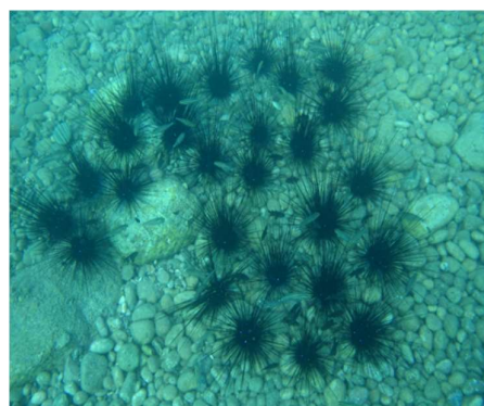
Figure 2. Density of D. setosum on the rocky and pebbly surface of Konyaaltı Beach (summer season of 2022).

The diving courses of Akdeniz University students is generally conducted in Antalya Cliffs, Konyaaltı Beach, Sığan Island, Çaltıcak Region, and Kemer Ağva Cape areas. Due to the excessive proliferation of D. setosum and the toxicity of its spines, sea urchins are observed and contact with them is avoided during these dives conducted throughout the year. During diving activities carried out in the summer months of 2022, it was observed that some individuals of D. setosum died. Initially, it was thought that these deaths were caused by fish or other organisms that consume sea urchins as food. Meanwhile, monthly samplings were conducted for a TÜBİTAK project related to D. setosum . It was observed during scuba dives conducted for these purposes that there was an increase in D. setosum mortality in the autumn months. These deaths continued to increase during the winter season, and meanwhile, a strong storm occurred in the Gulf of Antalya on January 27 - 28, 2023. Following this storm, during our scuba dives conducted in February and March, it was determined that 98-99% of the D. setosum population at diving and sampling stations had died. In all the areas where we dived, it was observed that the surviving sea urchins either shed their spines or had a decrease in their ability to move.