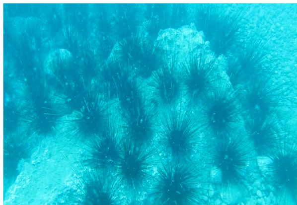
Figure 3. The density of D. setosum in a rocky area during the summer season of 2022

In our diversings in April-May, which are still ongoing in 2023, no live individuals of D. setosum could be found, but the spines and shells of dead individuals were encountered (Figure 4-5).