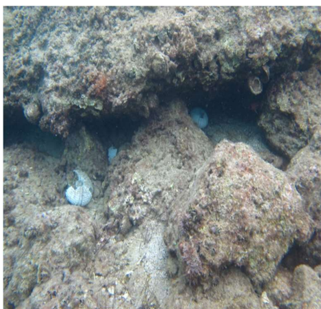
Figure 4. Shells of D. setosum found around rocks of Sican Island.

A similar mass death incident is also occurring with D. setosum , a Red Sea migrant. In the different regions of the Gulf of Antalya (Cliffs, Konyaalti Beach, Sican island regions, Calticak region, and Kemer Agva Cape), mass mortalities have been observed in the stations we determined, and no living D. setosum individuals have been encountered. In discussions with diving tourism centers in the region, it has been reported that these mortalities are also observed in Ucadalar, Beldibi, and Goynuk regions. Although these mass deaths in a foreign and invasive species may seem positive in a way, the pathogens causing them can also be a threat to native sea urchin species in the Mediterranean.